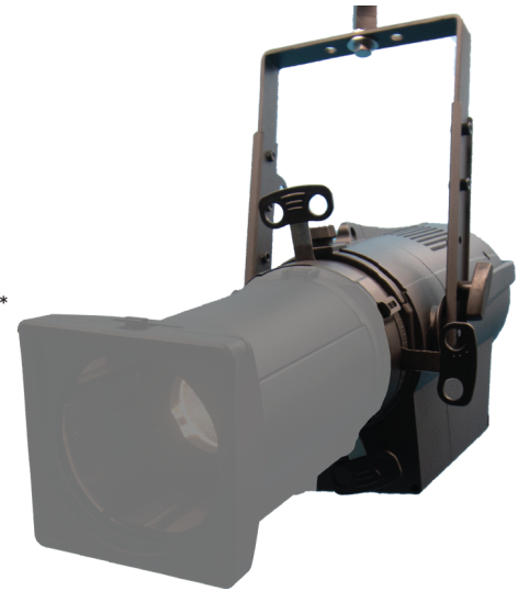
* shown with optional lens tube