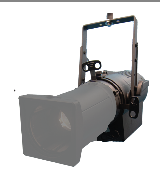
* shown with optional lens tube

Leko® LED Profile- the modern successor to the iconic Leko that inspired generations of designers, this profile fixture is available in full color which uses a Red, Green, Blue, Amber, Lime & Cyan color mixing system for the mixable color spectrum. To compliment the Full Color version two white output versions, a warm tunable white (2700 K to 4500 K), and cold tunable white (4000 K to 6500 K) varieties, both of which offer a consistent CRI exceeding >94 CRI across all color temperatures. The entire Leko family offer, far more than just in innovated color control, each of the fixtures utilizes new fan control technically and functions ensures these new high powered LED fixtures are suitable for use in the quietest of applications. To simplify installations, the Leko LED uses the SPX Smart Gate found on legacy SPX and PL4 fixtures and is compatible with existing SPX lenses, optional universal lens tube are also available for use with legacy LEKO lens tube and other common lens systems.