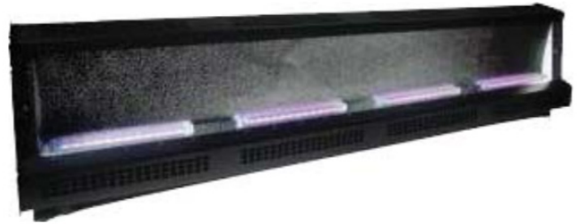
Spectra Cyc 400 RGBW

Designed for use on 10 to 16-foot centers, individual units can be linked side by side for greater saturation of light. The Spectra Cyc 400 is compatible with DMX / RDM protocols, and comes with a library of preprogrammed single colors and various color mixes. Units can be utilized for both floor and sky-cyc applications.