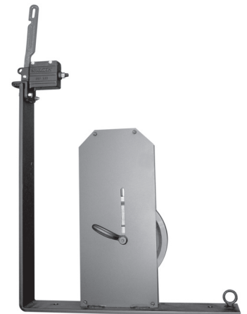
Adjustable Combination Floor Block 600-10818C75A