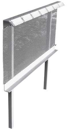
Gallery Mounted Locking Rail 011-558R6