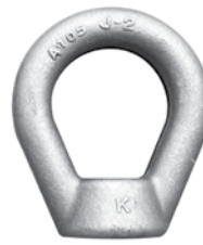
Eye Nut 048-3/4EN