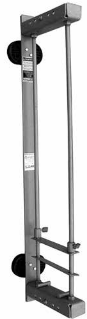
J-Guide/T-Bar Arbor Single Purchase 007-15X04

RWL: RWL is maximum load that can be applied to the arbor which is in "like new" condition and has been properly installed, maintained, and operated.