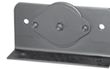
Light Duty Block 013-175