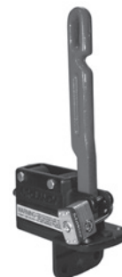
Rope Lock 010-533R

Rope locks are not designed to hold an imbalance of more than 50 lb (22.6 kg), nor to be used as a speed control.