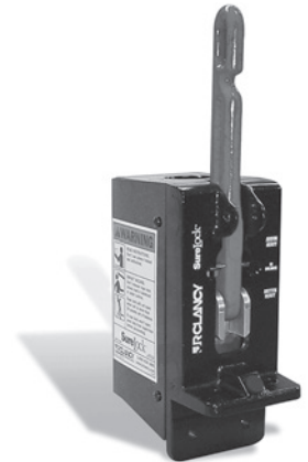
SureLock 010-600R US Patent 7,165,295

Rope locks are not designed to hold an imbalance of more than 50 lb (22.6 kg), nor to be used as a speed control.