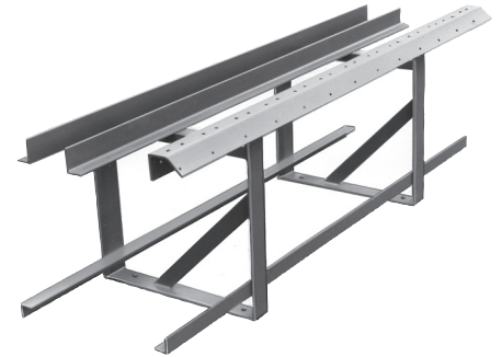
Wire Guide Locking Rail 011-518R6