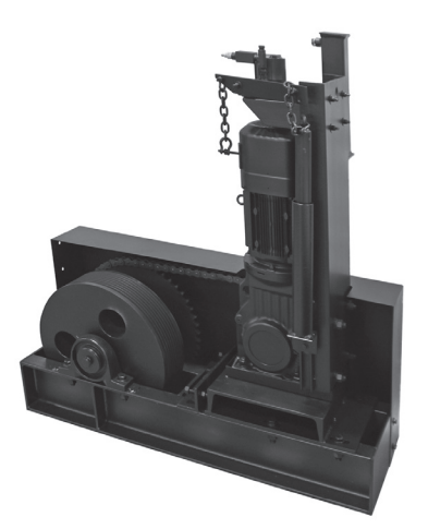
Traction Drive Hoist