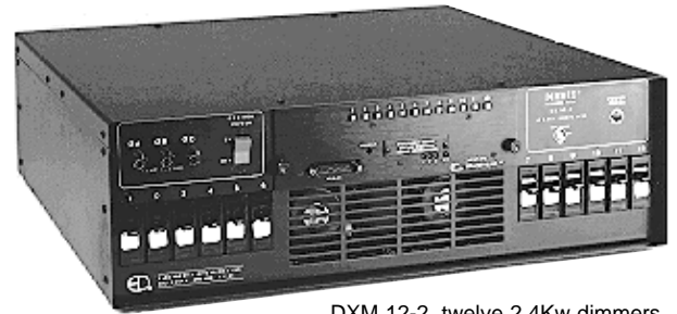
DXM 12-2, twelve 2.4Kw dimmers