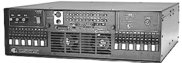
DXM 24-1, twenty-four 1.2Kw dimmers